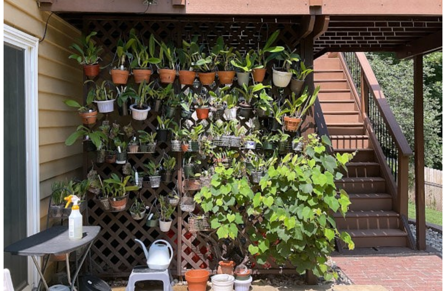
CIOS member Maria Fedorova's array of orchids summering under the shelter of a south-facing, second floor deck. An ideal spot for hanging orchids as it provides sun filtering, great airflow, weather sheltering, and convenient access for watering and care. A purpose built structure like a lath house would provide similar conditions but would cost considerably more.

An obvious solution is to "summer" your plants outdoors, letting them drink in bright light, fresh rain, and warm breezes.